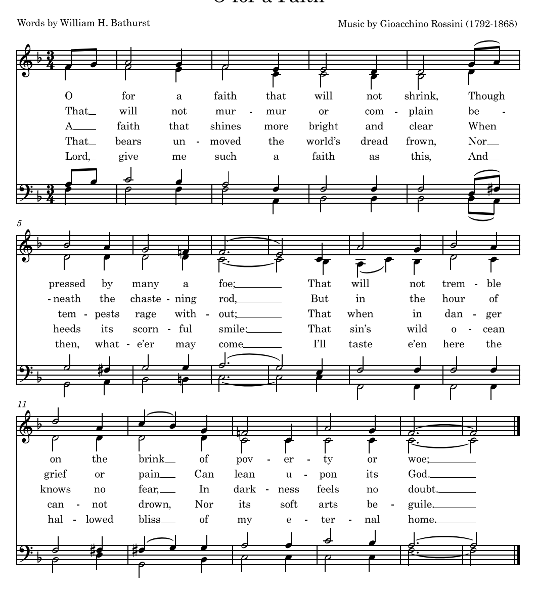
O for a Faith