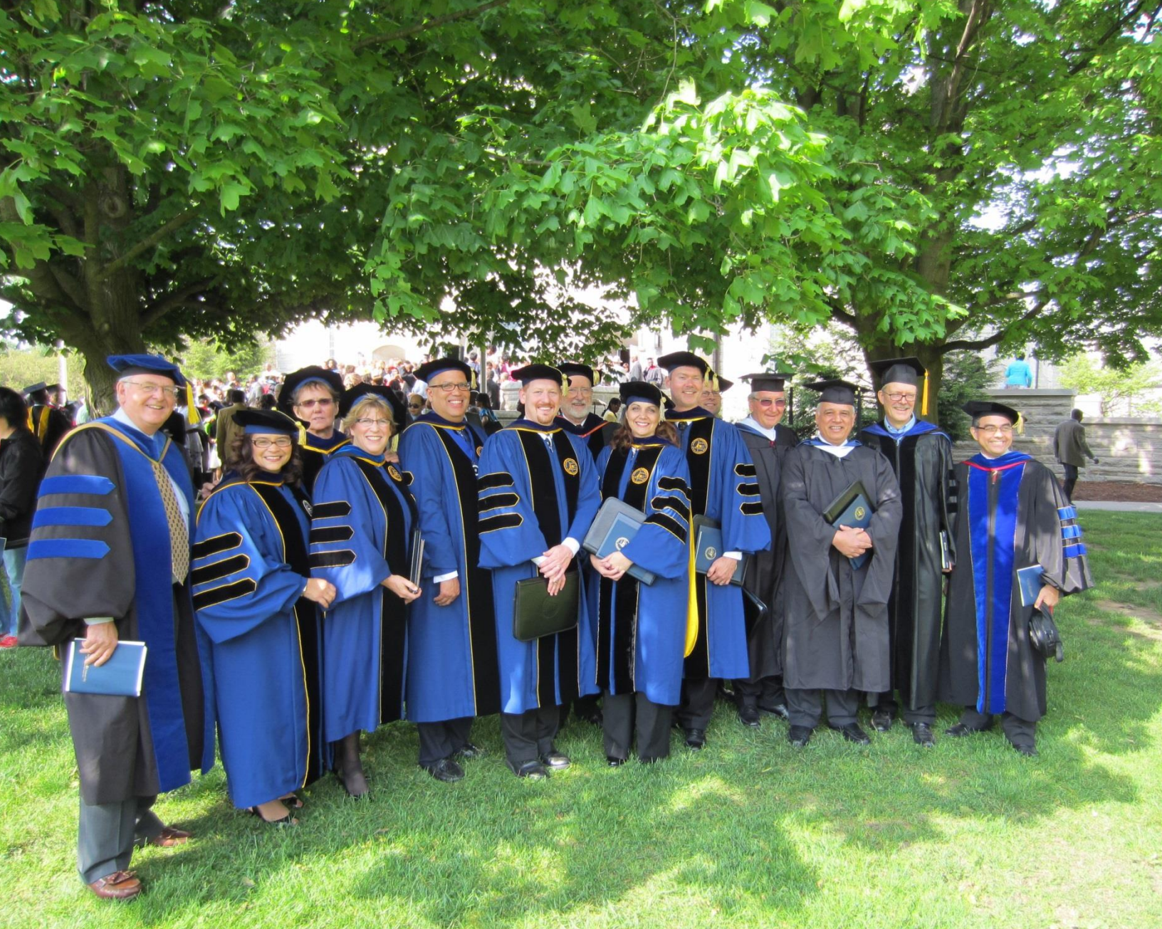
Graduates and faculty