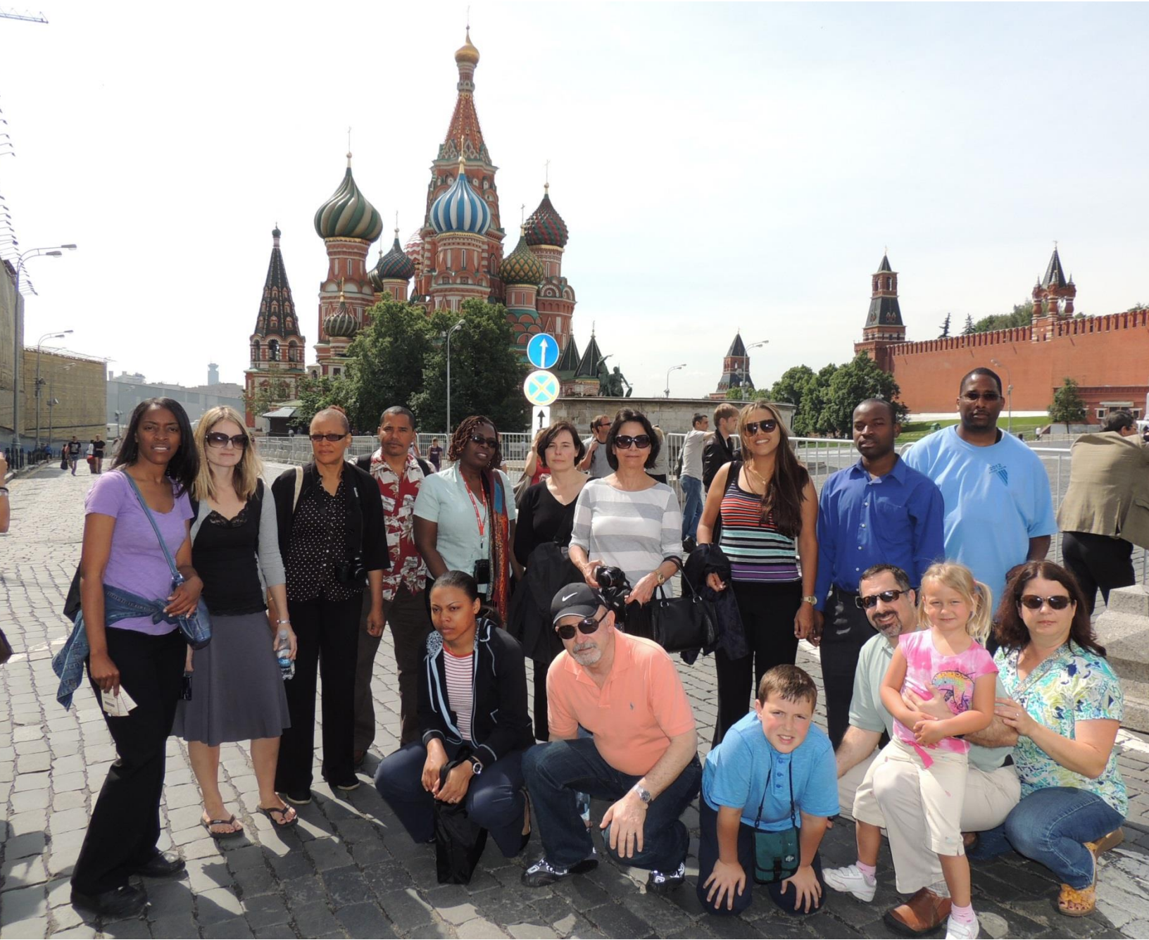
The Red Square in Moscow