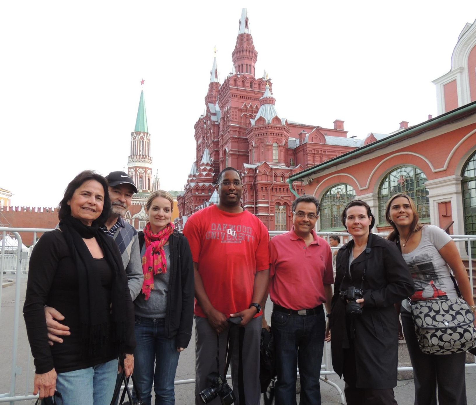
The Red Square