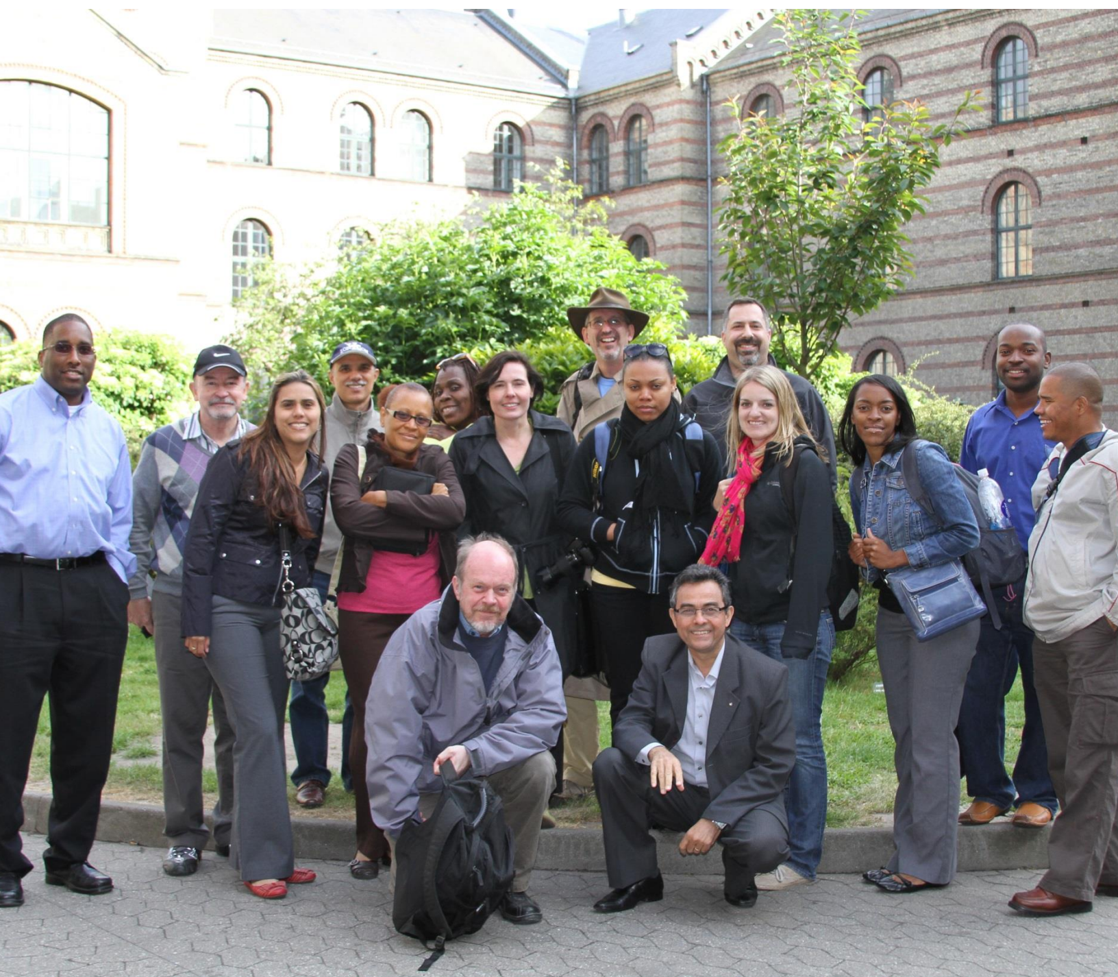
University of Copenhagen