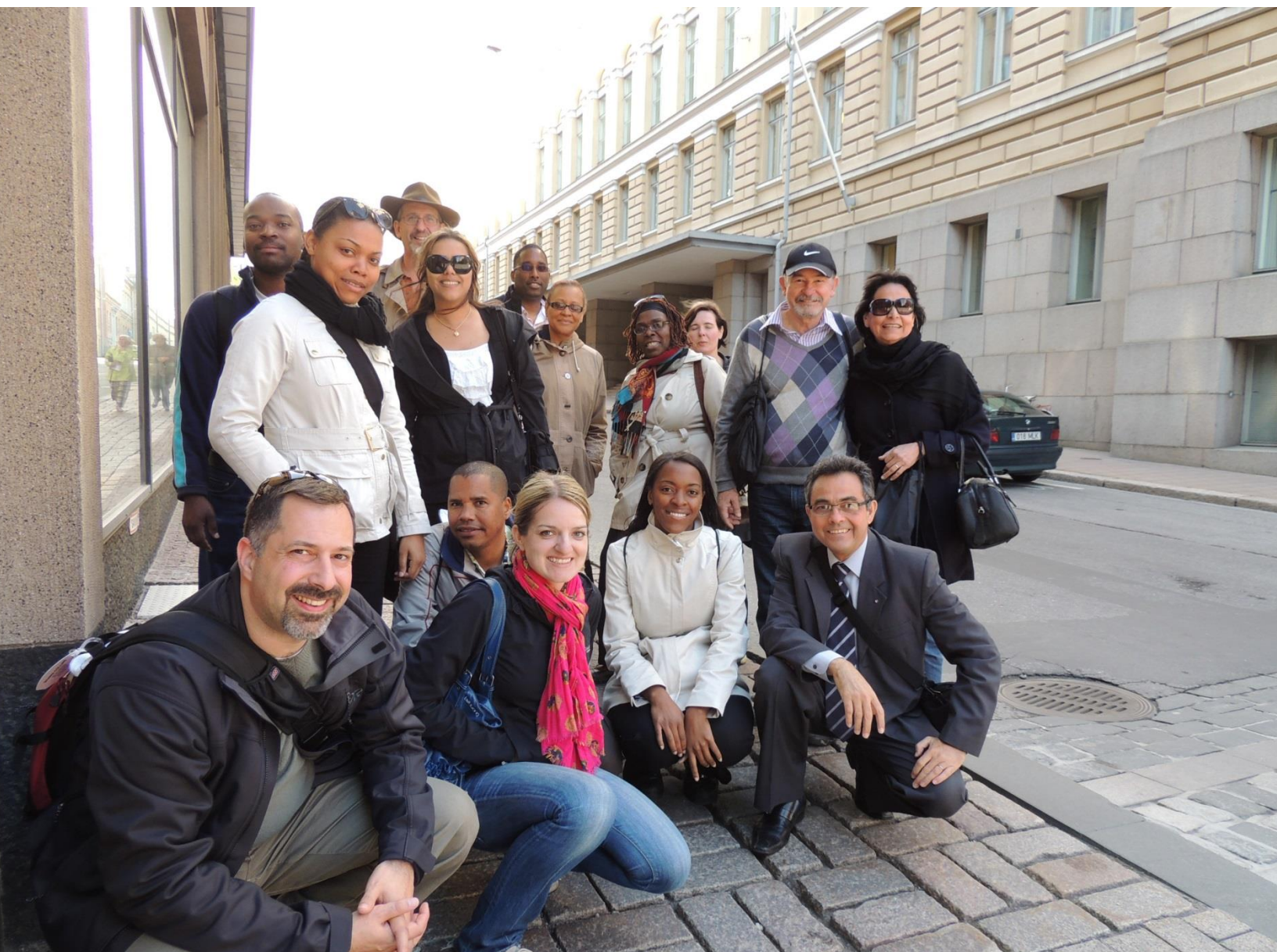
University of Helsinki