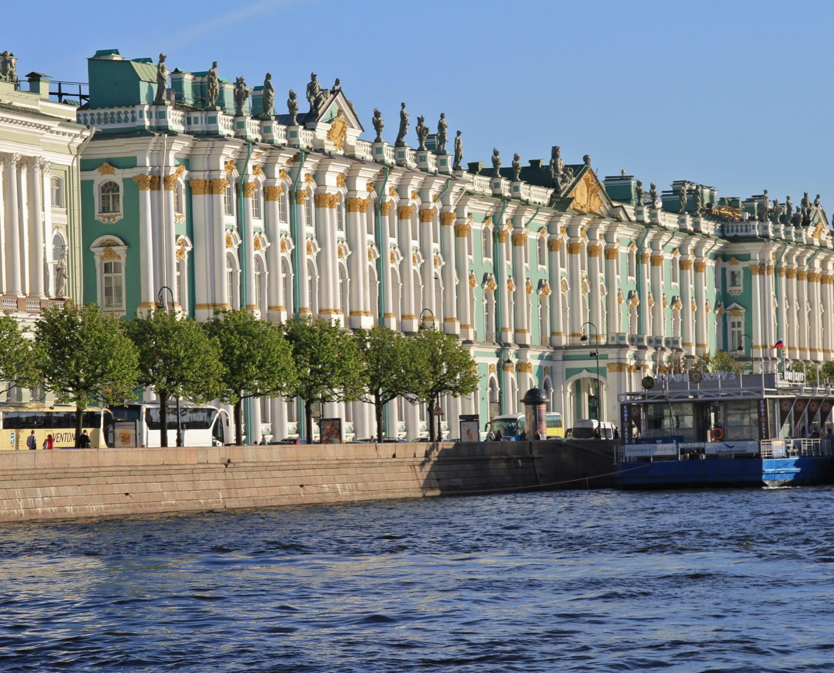
Hermitage Museum at St. Petersburg