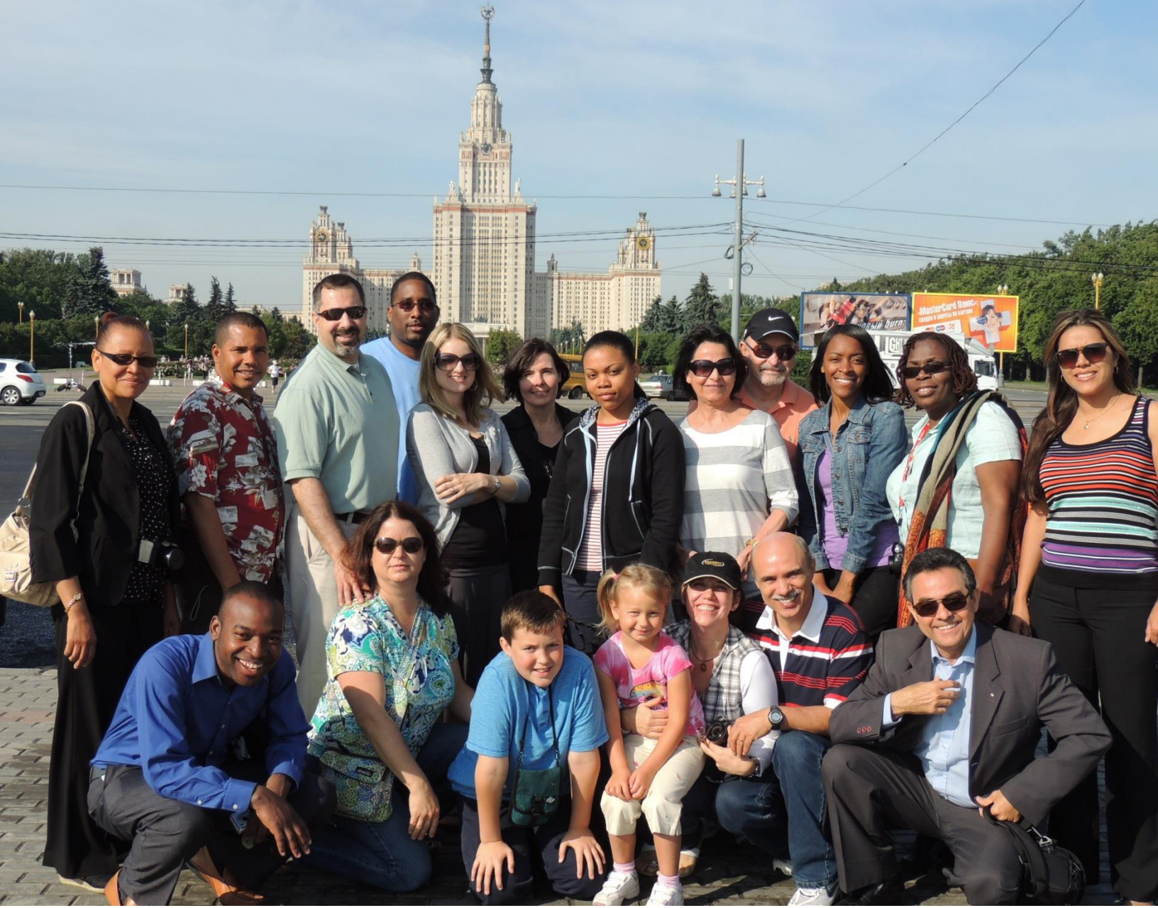
Moscow State University